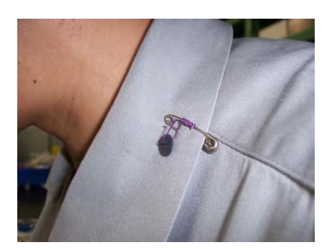
Ref) How to attach MonoTrap

Ultra inert WAX column InertCap Pure-WAX is highly recommended to analyze aromatic compounds together with MonoTrap