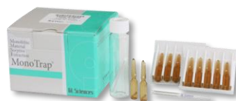
MonoTrap Trial Kit for TD

GL Sciences disclaims any and all responsibility for any injury or damage which may be caused by this data directly or indirectly. We reserve the right to amend this information or data at any time and without any prior announcement.